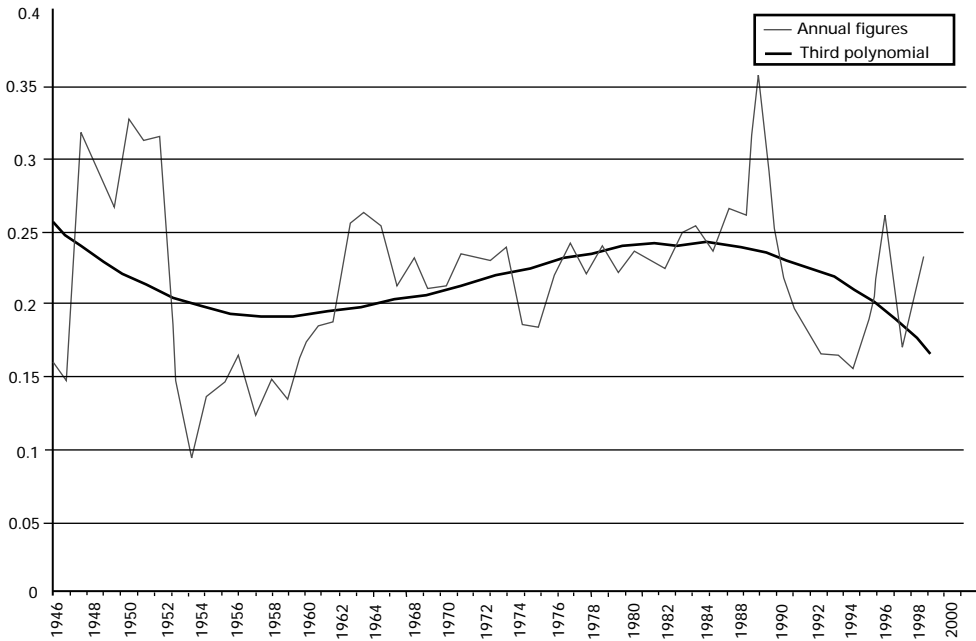
Figure 2. Probability that a Country Is Involved in Armed Conflict, All Levels, All Types, 1946–2001; Annual Figures and Long-Term Trend Line

world's leading military power. Most of the countries involved in these coalitions did not participate very actively in the combat operations, if at all. When we look at the probability that a particular country will be in conflict in a given year rather than the number of conflicts, we see a clear long-term decline through the Cold War period, although the decline is interrupted by the single-year peaks for Kosovo and Afghanistan.